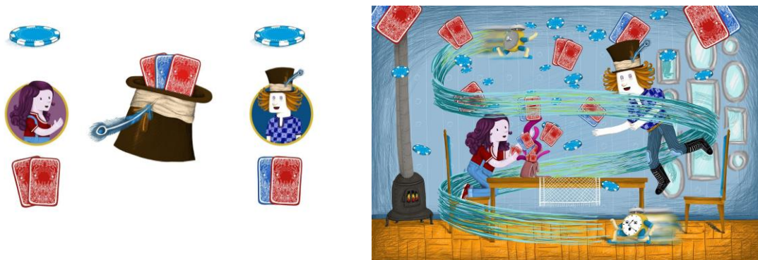
Figure 1: The card game between Alice and the Hatter, which addresses fundamental ideas about the empirical approach to probability.

The story is divided into chapters, each introducing a challenge that the protagonist must overcome by either playing or analyzing a game of chance focused on a fundamental idea of probability. The first two chapters present random experiments that involve card and dice games that are analyzed through the frequency-based and the empirical notions of probability. In one of them, Alice and The Hatter play a card game that she can win if she picks two cards of the same color from a hat with two red cards and a blue one (Figure 1). Even though the game has only two results it is not symmetrical, and thus it triggers a misconception: both possible results have the same likelihood of occurring. This common misconception is known in literature as the equiprobability bias, and it is described as a tendency for individuals to believe that any random outcomes share the same probability (Lecoutre, 1992). In the story, a magical clock starts running, accelerating time, which leads the characters to play the game very fast (Figure 1). After numerous repetitions, The Hatter says he knew what would eventually happen because he had played the game many times, thus introducing a fundamental idea of the empirical approach to probability. For this game, the mobile app includes a simulation of the experiment that dynamically shows the outcomes, thus enabling readers to contrast their initial beliefs with the empirical results obtained in a large number of repetitions.