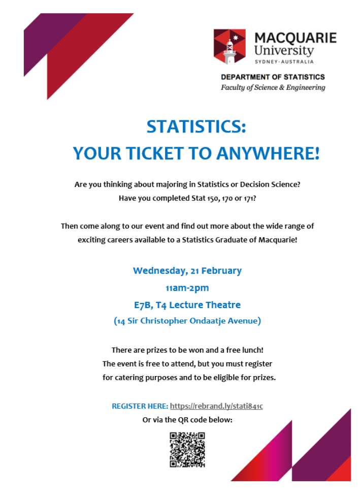
Figure 1. Statistics: Your Ticket to Anywhere! Invitation flyer

We called our outreach activity "Statistics: Your Ticket to Anywhere!" (Figure 1). We invited the chosen students to the event, initially with a postal invitation and later via the web service Eventbrite (the details are documented below). As well as individual invitations, we posted flyers in various places on campus and the department's web page.